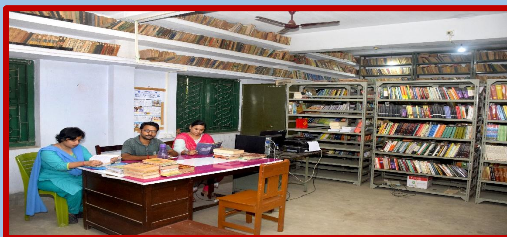
Teachers and Students in Library reading room and in Laboratory.