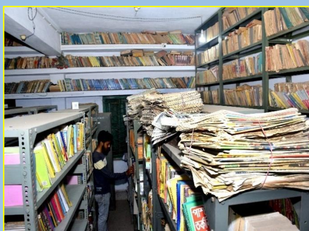
Glimpses of College Library