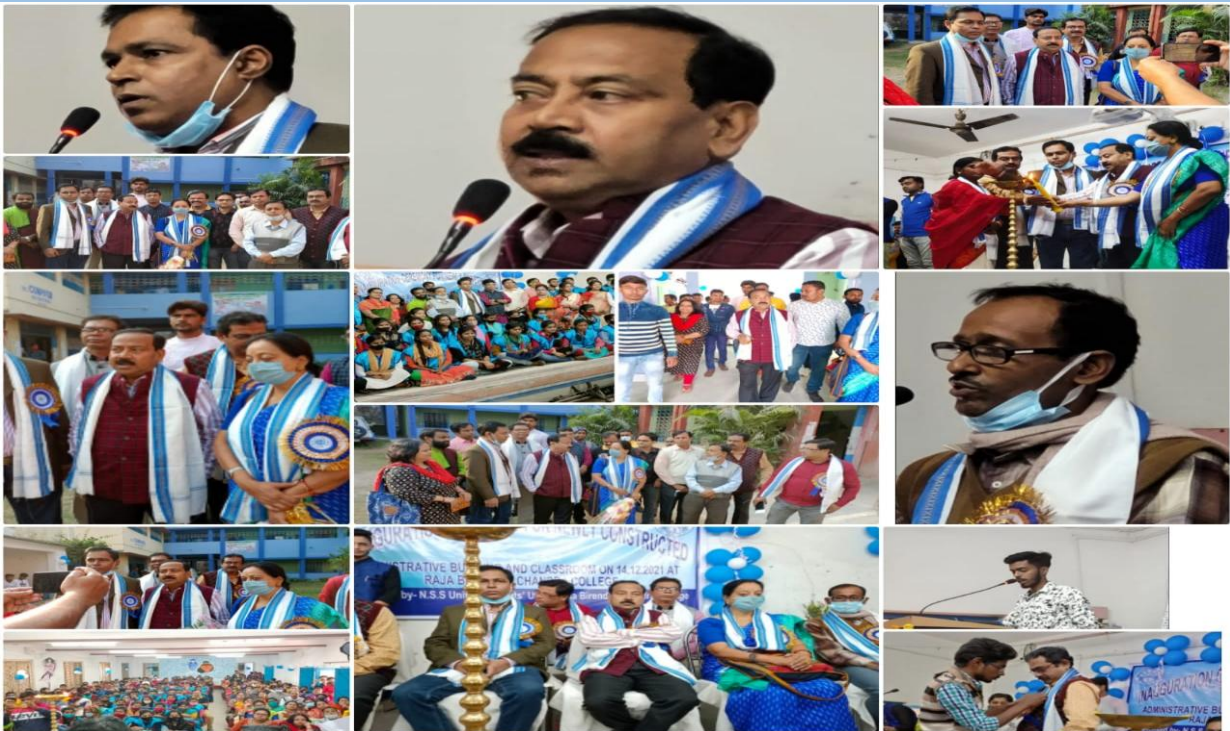
Glimpses of college activities